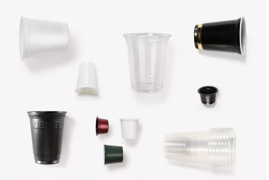
Cups and coffee capsules made of various polymers produced on the KTR Series. © KIEFEL GmbH