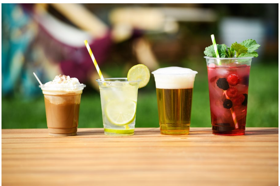
Variety of high-quality polymer cups manufactured in the SPEEDFORMER KTR 6.2 SPEED. © KIEFEL GmbH

SPEEDFORMER KTR 6.2 SPEED for efficient thermoformed polymer cup production. © KIEFEL GmbH